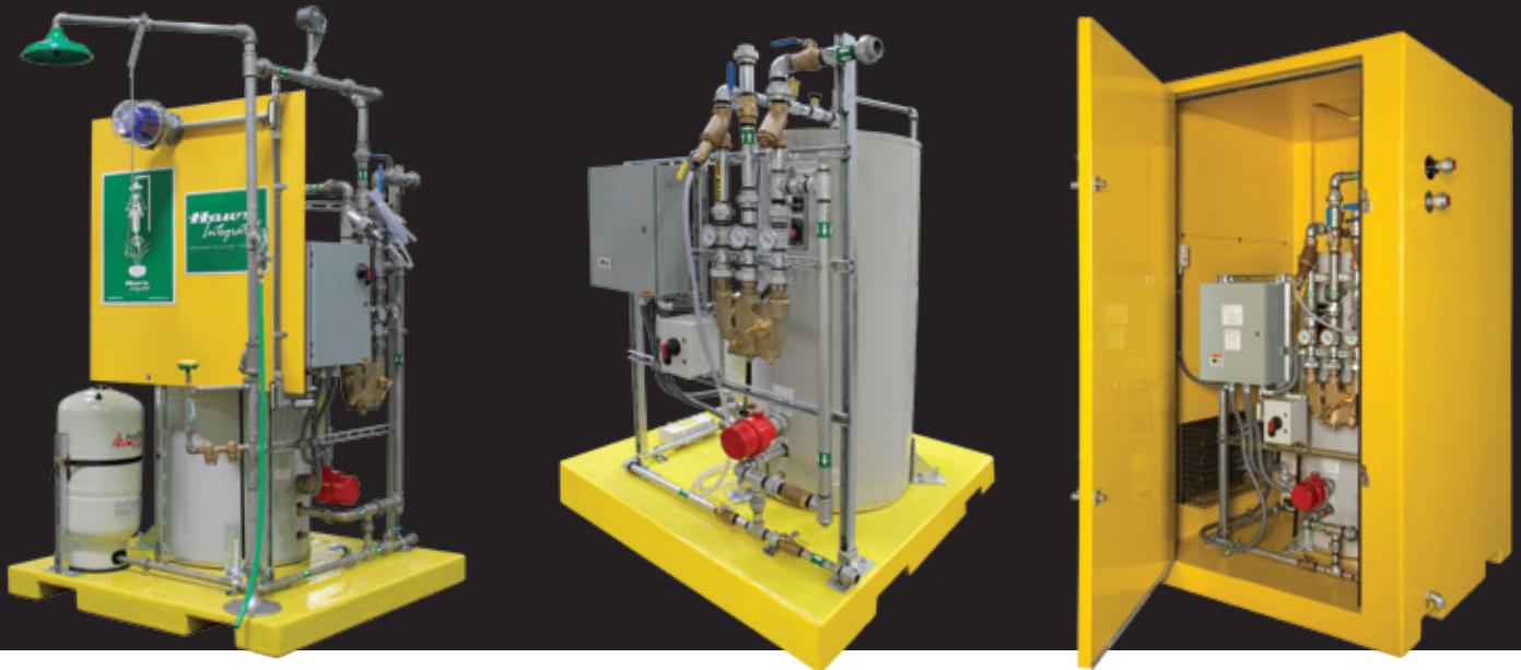
Model shown with additional light/alarm