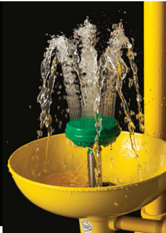
AXION Advantage eye/face wash head installed on Bradley Model S19-310FW